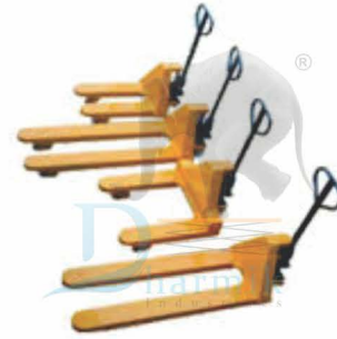
(DI-02) Heavy Duty Hand Pallet Truck