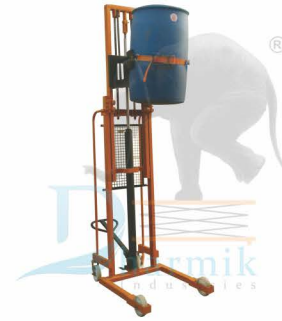
(DI-31) Drum Jockey