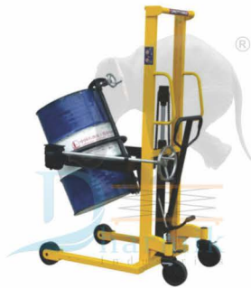
(DI-30) Drum Lifter Cum Tilter