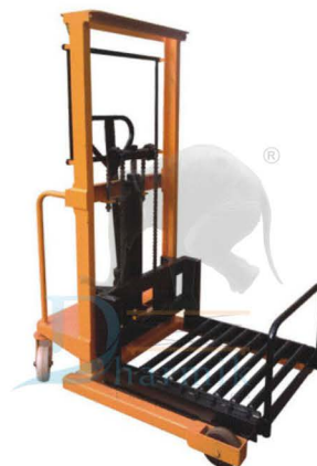
(DI-14) Hydraulic Roller Stacker