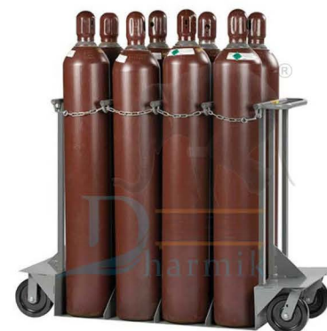
(DI-54) Cylinder Truck