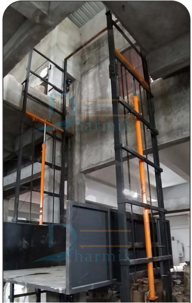
(DI-22) Hyd. Dual Support Goods Lift