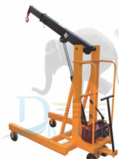
(DI-08) Heavy Duty Mobile Floor Crane