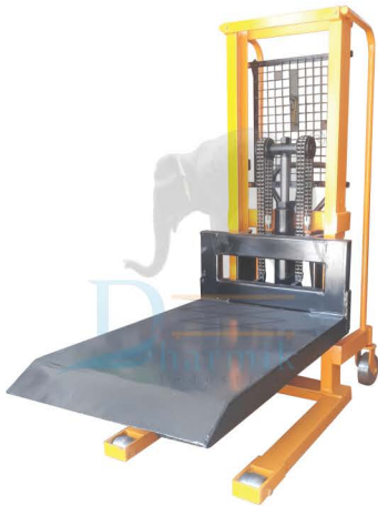
(DI-17) Hydraulic Platform Stacker