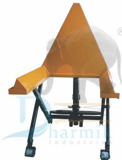
(DI-06) Highlift Beam Pallet Truck