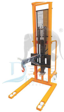
(DI-15) Hydraulic Hook Stacker