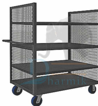
(DI-45) Portable Self Truck