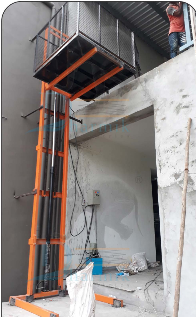
(DI-23) Hyd. Single Support Goods Lift