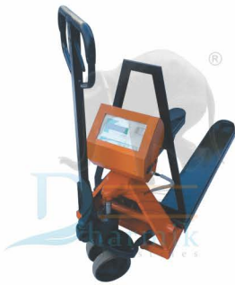
(DI-03) Weighing Scale Pallet Truck