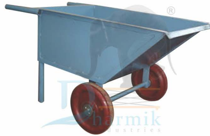
(DI-48) Double Wheel Barrow (UHMW Wheels)