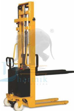
(DI-20) Semi Battery Stacker