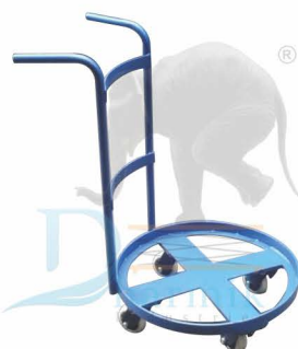
(DI-36) Drum Sifting Trolley