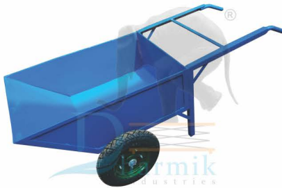
(DI-50) Double Wheel Barrow With Scooter Tyre