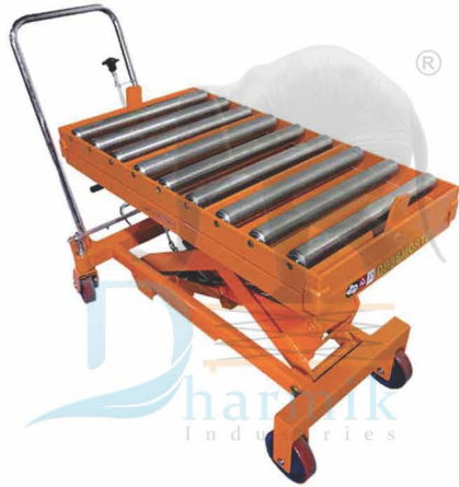
(DI-25) Die Loader / Roller Lift Table