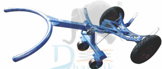
(DI-33) 4 Wheel Drum Trolley