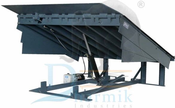
(DI-26) Hyd. Dock Levelers