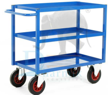
(DI-43) Tray Trolley