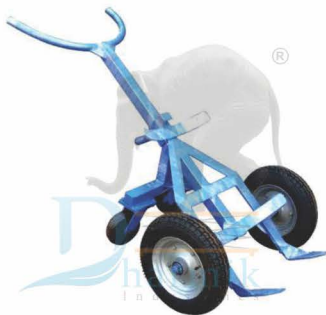
(DI-34) Drum Trolley Scooter Tyre