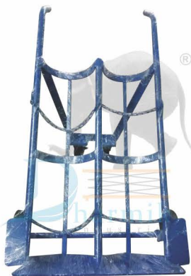
(DI-53) Double Gas Long Cylinder Trolley