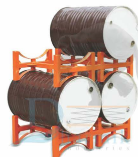
(DI-37) Drum Stand