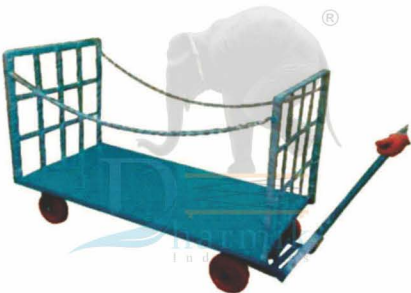
(DI-41) Two Side Platform Truck