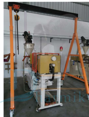
(DI-29) Portable Gentry Crane