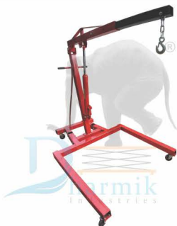
(DI-07) Manual Mobile Floor Crane