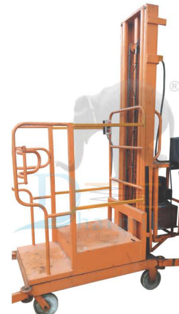
(DI-18) Hydraulic Order Picker