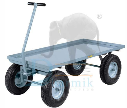
(DI-40) Platform Truck Scooter Tyre