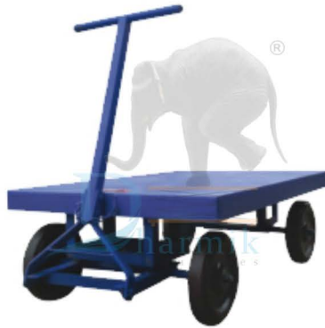
(DI-39) Platform Truck Turn Table