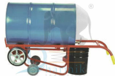
(DI-35) Drum Handler