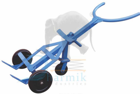
(DI-32) 3 Wheel Drum Trolley