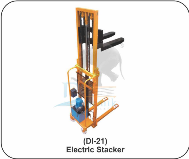
(DI-21) Electric Stacker