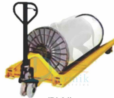
(DI-04) Paper Roll / Beam Pallet Truck