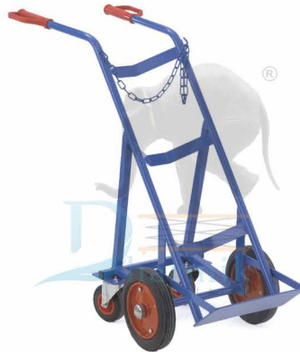
(DI-51) Single Gas Cylinder Trolley