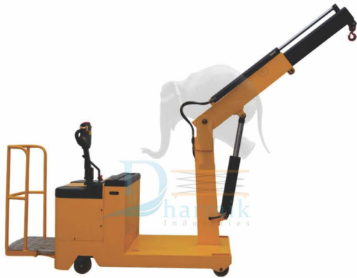
(DI-09) Semi Electric Mobile Floor Crane