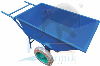
(DI-47) Single Wheel Barrow