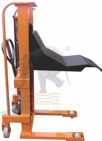
(DI-13) Hydraulic Reel Stacker