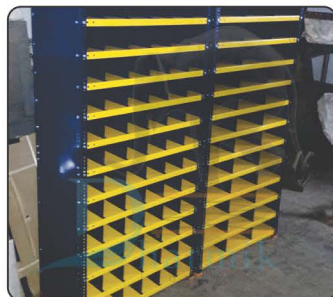
Cold Storage Rack