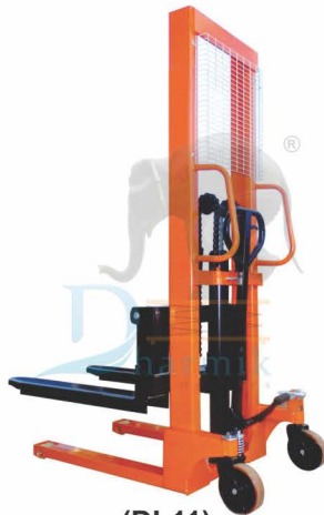
(DI-11) Manual Hydraulic Hand Stacker