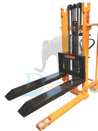
(DI-12) Heavy Duty Hydraulic Hand Stacker