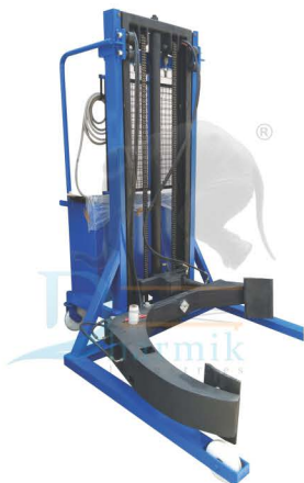
(DI-19) Hyd. Paper Roll Lifting & Rotating Stacker