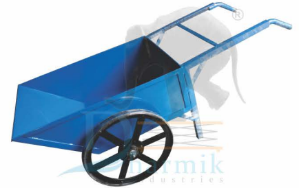
(DI-49) Double Wheel Barrow With M. S. Wheels