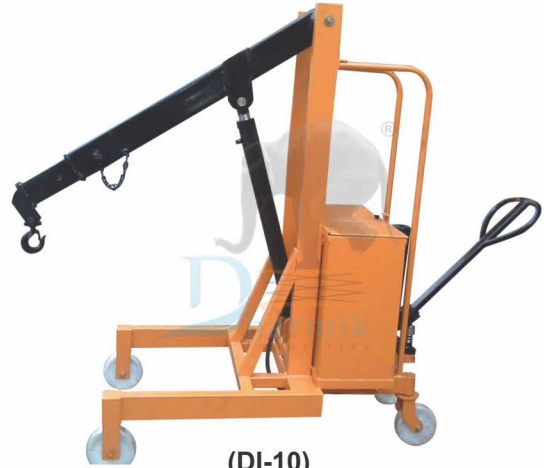
(DI-10) Semi Battery Mobile Floor Crane