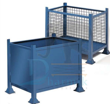
(DI-46) Wire Net Metal Pallet