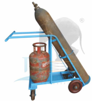
(DI-52) OXY / LPG Gas Cylinder Trolley