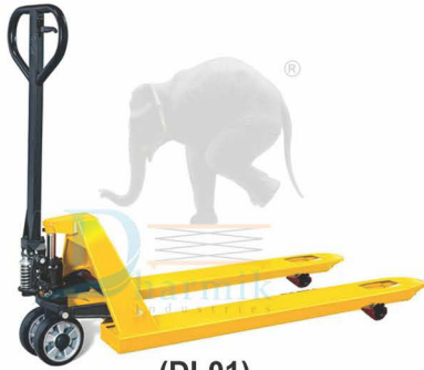
(DI-01) Hydraulic Hand Pallet Truck