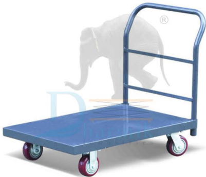
(DI-38) One Side Support Platform Truck