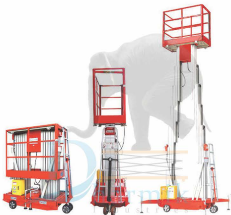
(DI-28) Aerial Work Platform