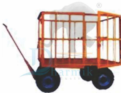
(DI-42) Door Type Platform Truck