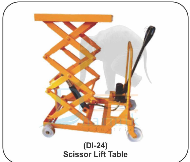
(DI-24) Scissor Lift Table