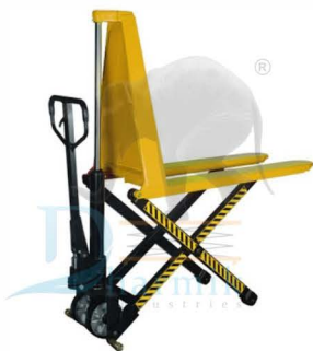
(DI-05) Highlift Pallet Truck