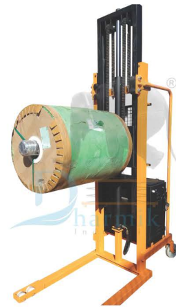
(DI-16) Hydraulic Boom Stacker